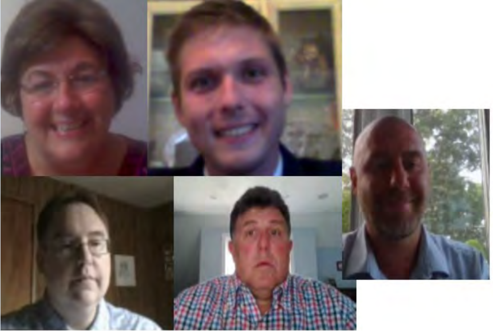
- This group picture of the Board of Selectmen was done social distanced via GoToMeeting, 2020 -

Select Board meetings are held on the second and fourth Mondays each month as well as potentially on the 5th Monday of the month when necessary. If a holiday falls on a Monday, meetings are held the following Tuesday. Minutes and agendas are available on the Town's web site. Meetings are televised live on Auburn Cable Television. During Covid-19, meetings are held remotely (access information on the Town's website).