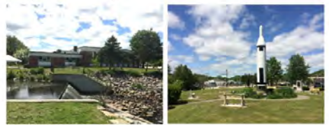
Auburn Free Public Library and monument to Goddard's rockets

The projected project cost is estimated to be $1 Million. Town Administration will be placing articles on the Annual Town Meeting warrant in May requesting approval for the remaining financing plan components.