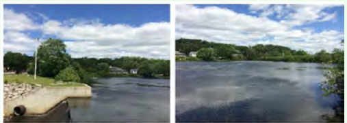
Views of Auburn Pond as seen from Goddard Park